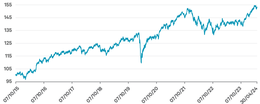
Figure 1: Performance of Davy UK GPS Moderate Growth Fund at 30 th April 2024

Warning: Past Performance is not a reliable guide to future performance. The value of your investment may go down as well as up. This product may be affected by changes in currency exchange rates.