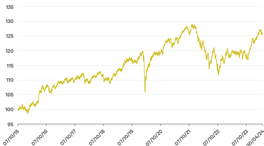
Figure 1: Performance of Davy UK GPS Cautious Growth Fund at 30 th April 2024

Warning: Past Performance is not a reliable guide to future performance. The value of your investment may go down as well as up. This product may be affected by changes in currency exchange rates.