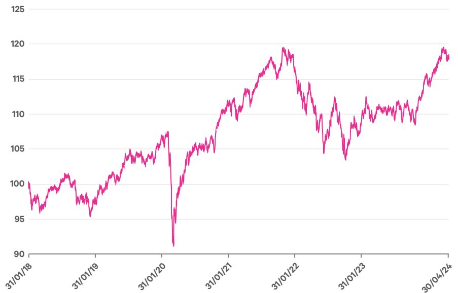
Figure 1: Performance of the Davy UK GPS Defensive Growth Fund at 30 th April 2024

Warning: Past Performance is not a reliable guide to future performance. The value of your investment may go down as well as up. This product may be affected by changes in currency exchange rates.