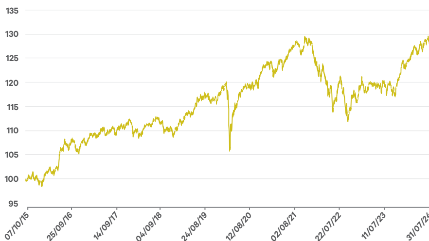
Figure 1: Performance of Davy UK GPS Cautious Growth Fund at 31 st July 2024

Warning: Past Performance is not a reliable guide to future performance. The value of your investment may go down as well as up. This product may be affected by changes in currency exchange rates.