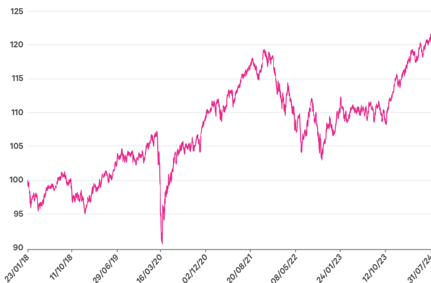
Figure 1: Performance of the Davy UK GPS Defensive Growth Fund at 31 st July 2024

Warning: Past Performance is not a reliable guide to future performance. The value of your investment may go down as well as up. This product may be affected by changes in currency exchange rates.