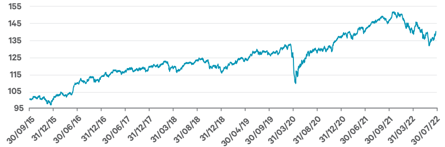
Figure 1: Performance of Davy UK GPS Moderate Growth Fund at 31 st July 2022

Warning: Past Performance is not a reliable guide to future performance. The value of your investment may go down as well as up. This product may be affected by changes in currency exchange rates