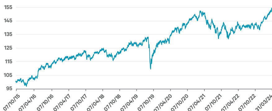
Table 1: Performance (Net of Fees) 5