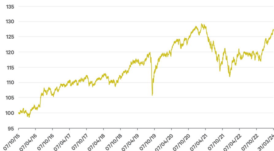
Figure 1: Performance of Davy UK GPS Cautious Growth Fund at 31 st March 2024

Warning: Past Performance is not a reliable guide to future performance. The value of your investment may go down as well as up. This product may be affected by changes in currency exchange rates.