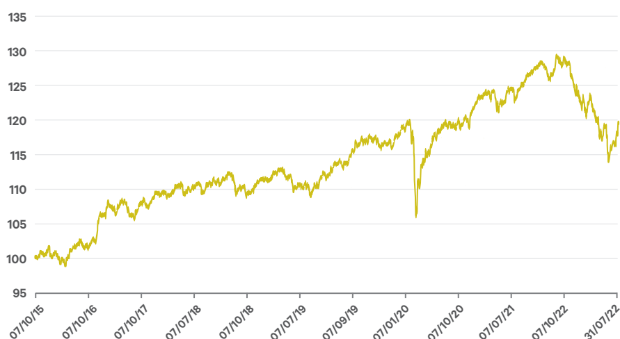
Figure 1: Performance of Davy UK GPS Cautious Growth Fund at 31 st July 2022

Warning: Past Performance is not a reliable guide to future performance. The value of your investment may go down as well as up. This product may be affected by changes in currency exchange rates