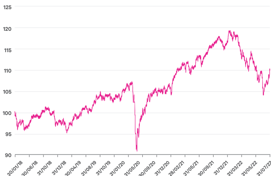
Figure 1: Performance of the Davy UK GPS Defensive Growth Fund at 31 st July 2022

Warning: Past Performance is not a reliable guide to future performance. The value of your investment may go down as well as up. This product may be affected by changes in currency exchange rates