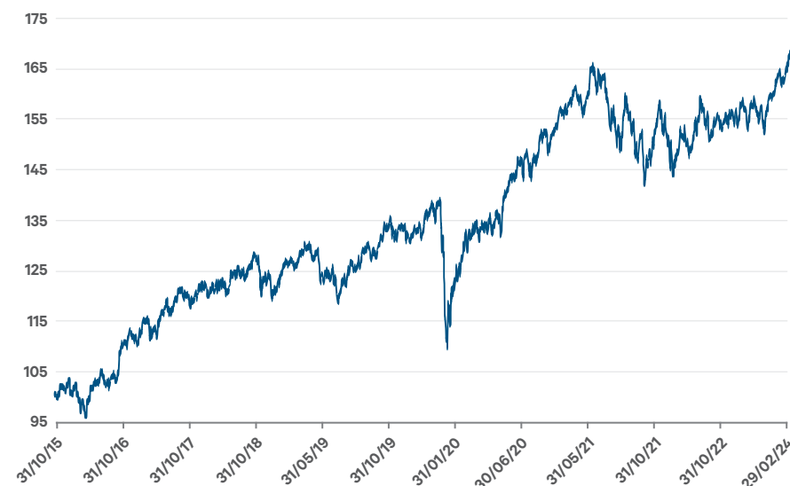
Figure 1: Performance of Davy UK GPS Long Term Growth Fund at 29 th February 2024

Warning: Past Performance is not a reliable guide to future performance. The value of your investment may go down as well as up. This product may be affected by changes in currency exchange rates.